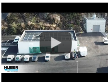
Video: Complete wastewater treatment at the Øygarden WWTP in Norway

https://www.youtube.com/watch?v=BKPMhiNjmRI